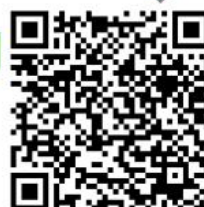
English audio file

When you feel dizzy: Play and follow these instructions. At the same time record eye movements.